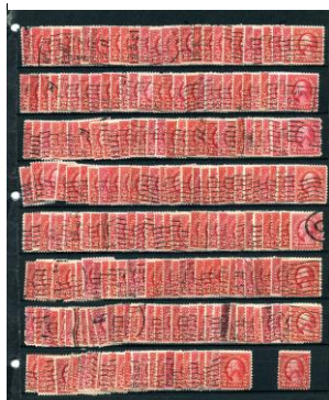
Stephen Drew – Show & Tell Presentation U.S. 634A: The Fine Lines of Type II