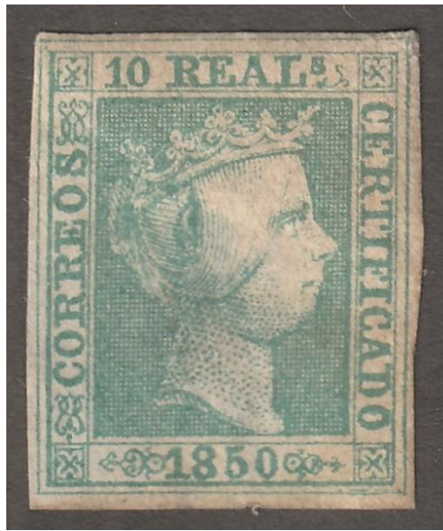
Spain, Scott#5, used, certified, $1,200.00 usd

For as long as I can remember, as a stamp collector and now a stamp dealer, I have always hoped to find that million-dollar stamp. That one stamp we all read about and hear about that has to be out there somewhere in the world. (Just not in my neighborhood) Who wouldn't want to find that one stamp that has been skipped over in the 0.25cent bin at the local stamp club. Speaking of 'skipped over', I found this stamp in the collection I bought.