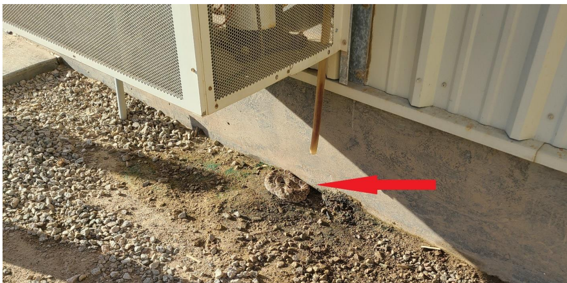
Resident snake under Ac unit.

I hope this message finds you all healthy and happy. Speaking of healthy, Arizona USA, the temperatures are climbing every day. On average, the temps here are 115f for the next three months. It's summer time. Along with high temps, we often run into the desert critters that live here. One such critter is the Rattlesnake. They have a job to do in this world and they can do it far, far away from me. For example, at work the other day I stumbled upon this nice example.