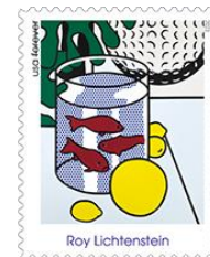
Roy Lichtenstein Forever Stamps April 24 | New York, NY

The work of the iconic American artist of the pop art movement, Roy Lichtenstein (1923-1997) is celebrated with a stamp issuance in his honor. Each of the five stamps in this pane of 20 features one work of art by Lichtenstein: "Standing Explosion (Red)" (porcelain enamel on steel sculpture, 1965); "Modern Painting I" (oil and magna on canvas, 1966); "Still Life with Crystal Bowl" (oil and magna on canvas, 1972); "Still Life with Goldfish" (oil and magna on canvas, 1972); and "Portrait of a Woman" (oil and magna on linen, 1979).