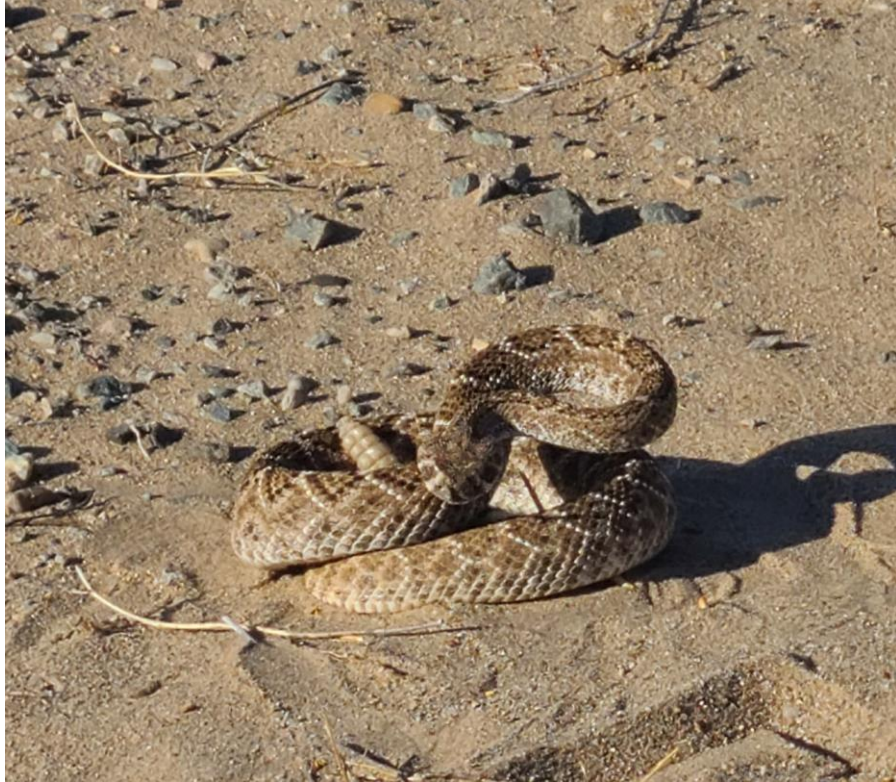
Mr. Snake in the desert.

After I let Mr. Snake out of the snake bag, he promptly let me know he was very unhappy about being moved by the picture seen here. This is the classic 'strike' pose most snakes will get into prior to striking someone/something that gets too close to them. He rattled and rattled. Mind you I was 10+feet away from Mr. Snake. (Remember, I don't like snakes and stay as far away from them as I can be.)